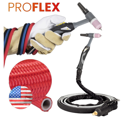
TIG torch SPARTUS® Pro 17 1B X

In addition to the presented configurations, we additionally recommend compatible Spool Gun holders, gas regulators, foot controls and other SPARTUS® accessories.