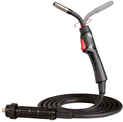
MIG gun SPARTUS® 150R with a rotary torch head