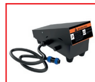
WIRED FOOT PEDAL