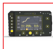
REMOTE CONTROL PANEL