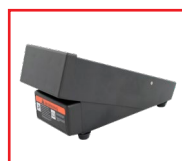
WIRELESS FOOT PEDAL