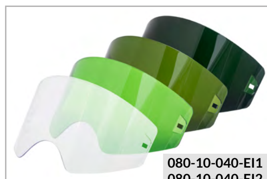
080-10-040-EI1 080-10-040-EI2 080-10-040-EI3 080-10-040-EI5