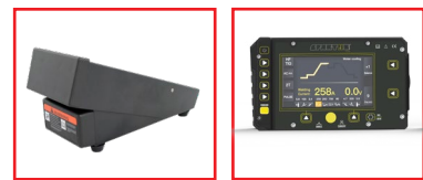
WIRELESS FOOT PEDAL REMOTE CONTROL PANEL