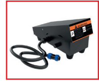
WIRED FOOT PEDAL