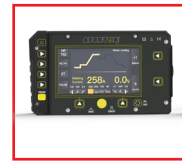
REMOTE CONTROL PANEL