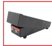
WIRELESS FOOT PEDAL