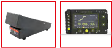
WIRELESS FOOT PEDAL REMOTE CONTROL PANEL