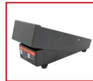
WIRELESS FOOT PEDAL